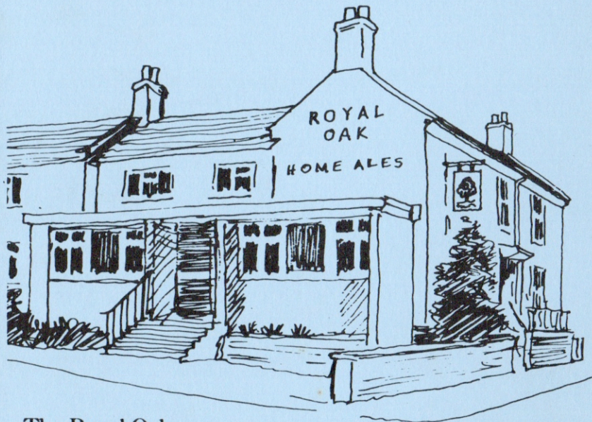
The Royal Oak