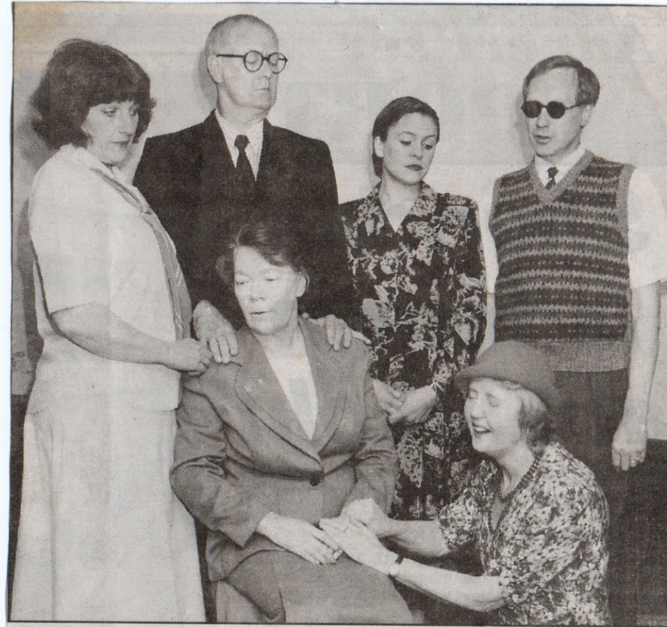
W. SOMERSET MAUGHAM'S Thirties' drama, For Services Rendered , in which a family reaps the full rewards of its first world war efforts, will be presented by East