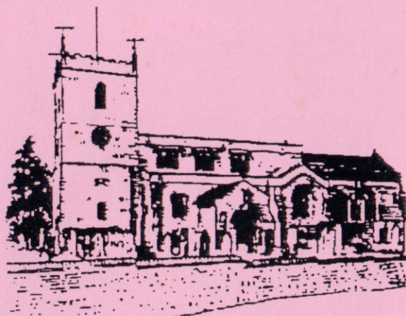
ST PETER (13th Century) East Bridgford