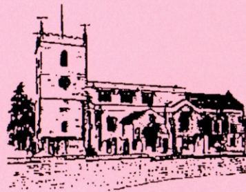
ST PETER (13th Century) East Bridgford