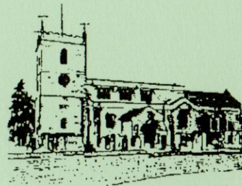
ST PETER (13th Century) East Bridgford