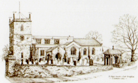
St Peter, East Bridgford's 13th Century church