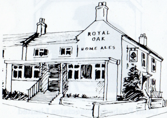
The Royal Oak