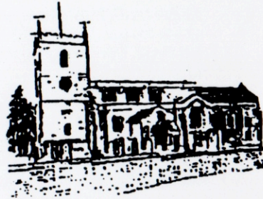
Why not visit our Sunday Services? St Peter (13th Century) East Bridgford

Our next production will be the thriller "Edge of Darkness"