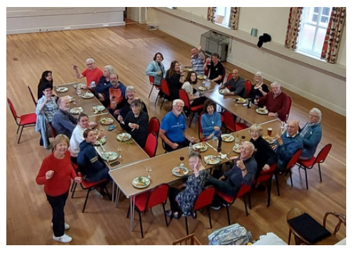
Enjoying food and wine together after set strike.