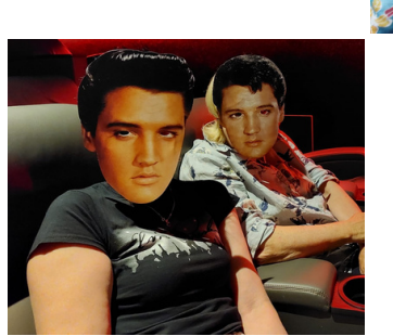
They are fans of Elvis!

They were at the first showing of the latest Elvis film.