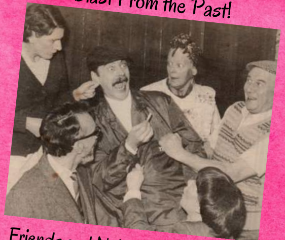
Friends and Neighbours - Feb 1987